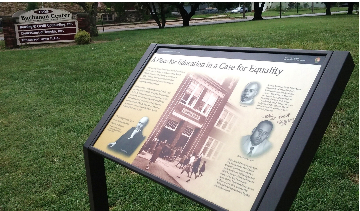
These pictures were taken on Tuesday, September 8, 2015.